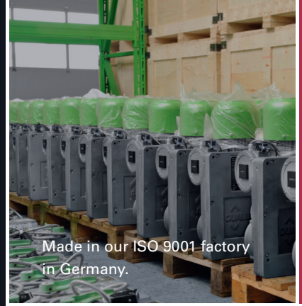
Made in our ISO 9001 factory in Germany.